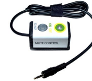
EXT. MUTE control 9550ZDB