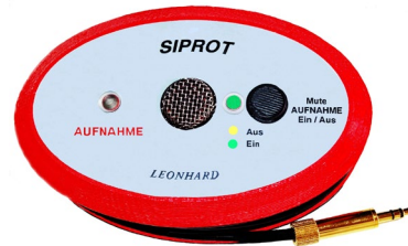
Voice Controlled MIKROPHON 9550BA