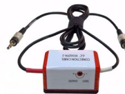
CONNECTION CABEL 9550ZDA-2