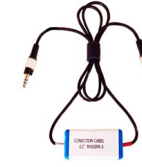
CONNECTION CABEL 9550ZDA-3