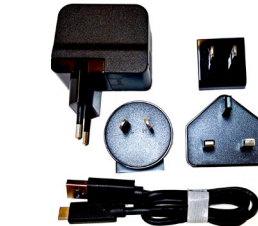
POWER SUPPLY 9550ZCB