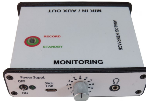
ANALOG-INTERFACE 9550ZEF and ANALOG-INTERFACE 9550ZEG with MUTE-control

Note: This MIC.-BUS amplifier can Also be used as an INTERFACE backup device in a emergency