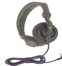
HEADSET LC 560