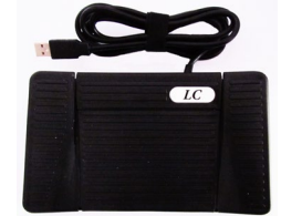
FOOT SWITCH 9550ZA