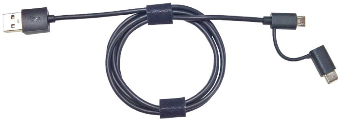
Power cable USB A> USB Micro / USB C

BATTERY instead of the power supply 9550ZCB. For a Grid-independent operation of the SIPROT system. Capacity: 15 -25 operating hours, depending on Number of installed microphones.